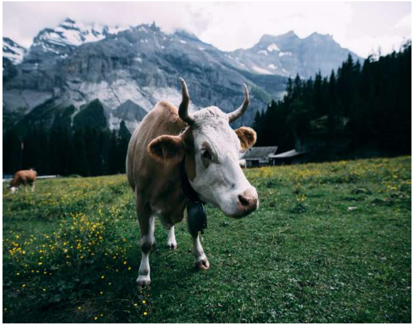
Ilustrasi Dairy Farms, Photo by Heiner (Switzerland)

Ely Estiningtyas (Indonesia), Abdul Malik (Indonesia)